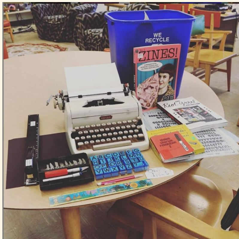
Some of the supplies we gathered for the library zine-making cart, to accompany the Sophomore English unit.