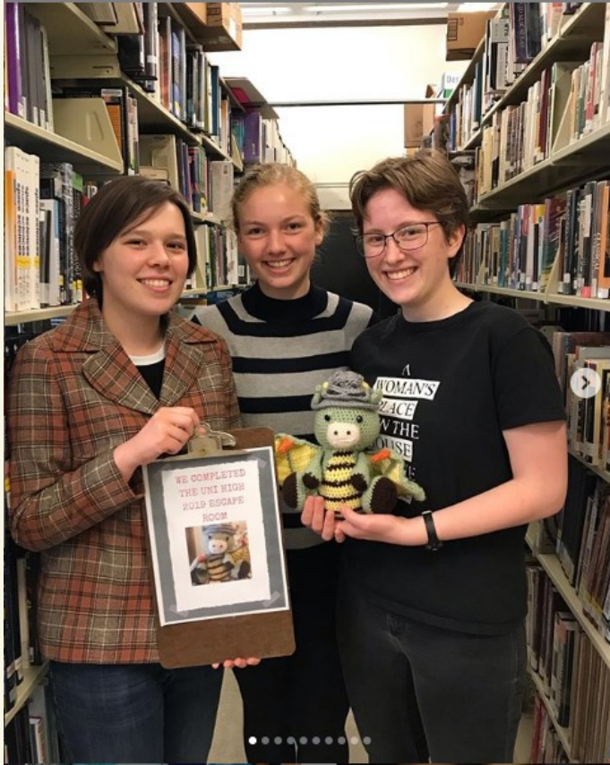
In the Uni High Escape Room of 2019, here is one of the winning teams.