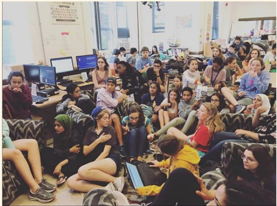
Uni High students gathered for the screening of Love, Simon Part 1.