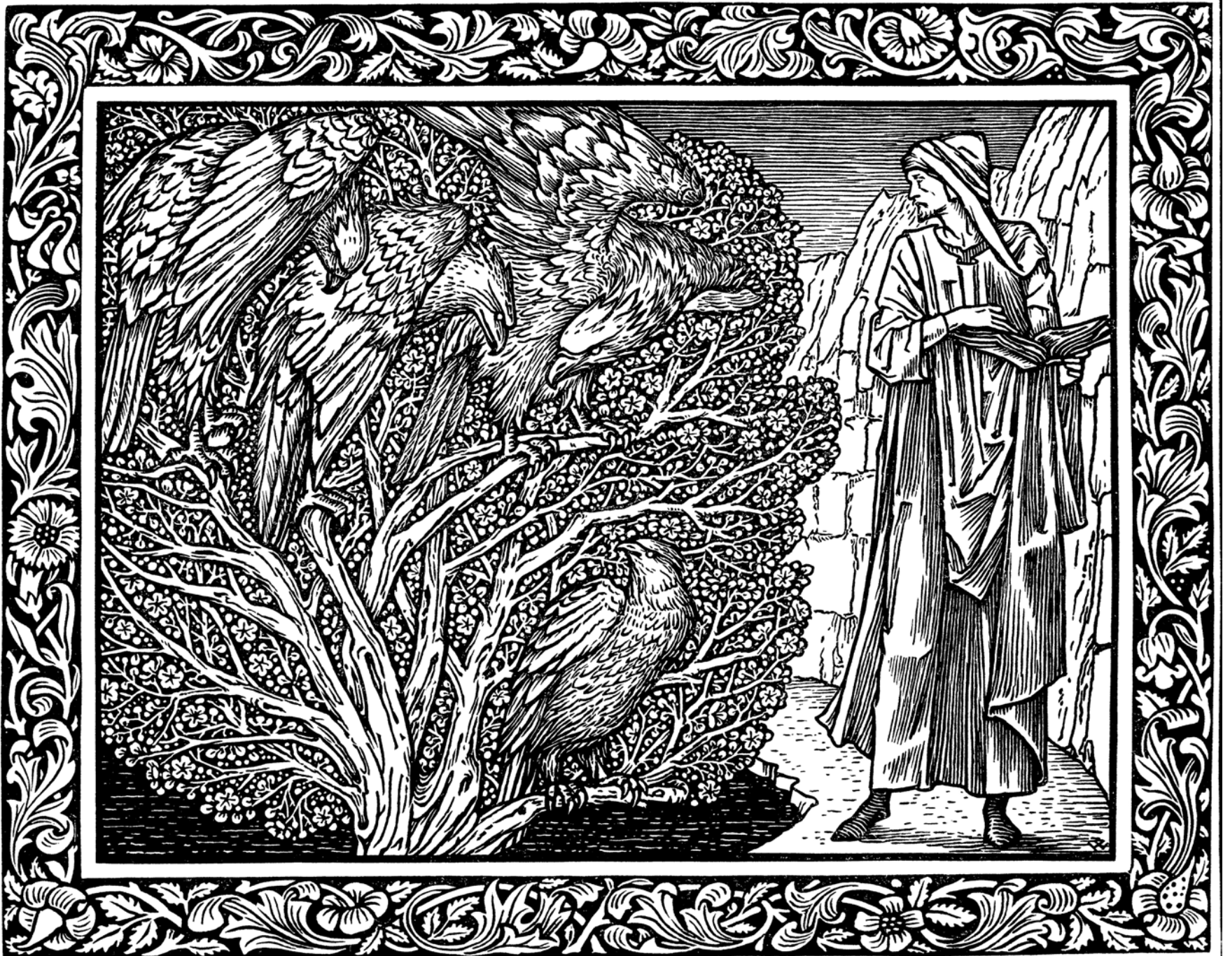
✿✿ THE PARLEMENT OF FOULES ✿✿ THE PROEM. ✿✿✿✿