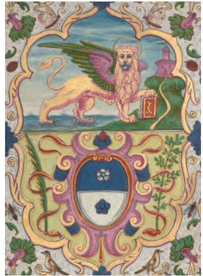
Item 4.3, detail

Titles of nobility played an important role in Italian history and went through significant change during Cavagna's lifetime. Fittingly, the collection contains important resources for genealogical and heraldic studies, including general manuals, originals and transcripts of wills and investitures, and registers of nobility. Royal, ecclesiastic, family, or city coats of arms are detailed and diagrammed in many colorful volumes. The collection is rich in histories and genealogies of noble families, as well as genealogical histories of different cities and regions across Italy. Works on orders of knighthood and chivalry and military religious orders, in particular the Knights of Malta, including their emblems and costumes, also feature prominently in the collection. Histories of royal families across Europe, especially the House of Savoy, also make up a significant portion of the genealogical works in the collection.