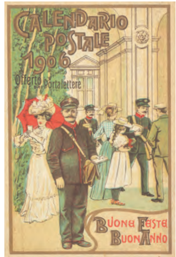
Item 3.2, 1906 issue