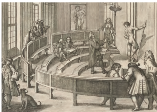
Item 5.1, detail

Art and architecture are celebrated in works on the cathedrals, monuments, sculpture gardens, cemeteries, and architectural masterpieces of Italy, especially of the Lombardy and Piedmont regions. The Cathedral of Milan and the Certosa of Pavia are especially well represented. Exhibition catalogs of museums and galleries in Milan document the artistic culture of the nineteenth century, as do libretti and theater programs. Antiquities and Roman ruins are detailed in works on numismatics, inscriptions, and archaeological discoveries. The collection also has practical manuals and technical handbooks; biographies of artists; histories of art collections and museums, both private and civic; histories of art academies and guilds; and philosophical works on art, architecture, and aesthetics.