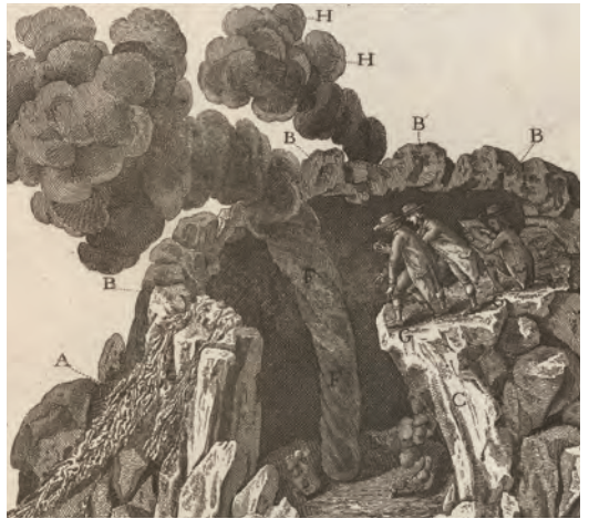
Item 2.1, detail

From railroads to rinderpest, Cavagna collected widely in scientific works, but focused mostly on subjects that had profound effects on shaping Italy—both physically and demographically. Historical works on plague outbreaks and contemporary works on the prevention and treatment of cholera and malaria are particularly well represented. The collection contains a significant number of works on hydrotherapy and the composition and therapeutic use of mineral waters found across Italy. Volcanology, geology, and archaeology are strongly featured, as are agricultural topics such as sericulture, risiculture, and the prevention of livestock diseases. Civic and hydraulic engineering—from Roman times to the Risorgimento—are also strengths of the collection, especially works on land reclamation and river and flood control.