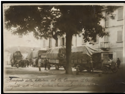
Photograph of the transport of the Cavagna Sangiuliani Collection from Zelada (or Zelata), province of Pavia